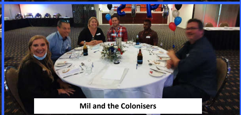
Mil and the Colonisers