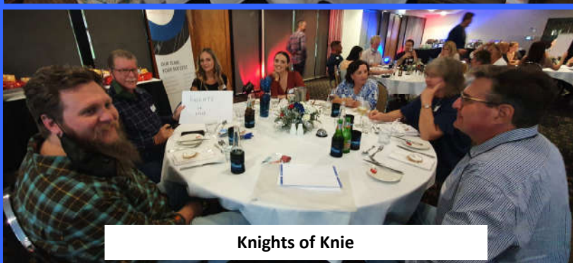
Knights of Knie