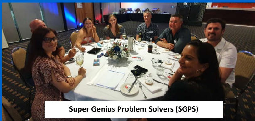
Super Genius Problem Solvers (SGPS)