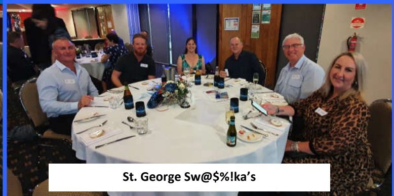
St. George Sw@$%!ka's